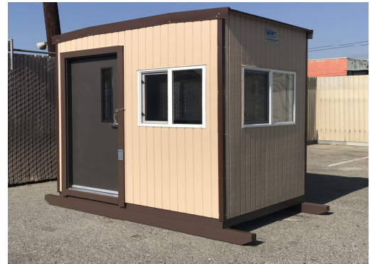
typical exterior appearance

FOB: Gardena, CA 90248 Shipping to be added